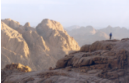
Psalm 31 — A Rock of Refuge